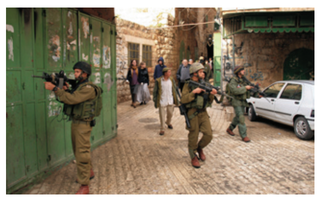
Israeli settlers tour Hebron escorted by soldiers

Despite their obligations to the protected population of the Occupied Territory, Israeli forces are stationed in the West Bank, including East Jerusalem, to protect settlers and settlements. Soldiers are often involved in facilitating attacks by settlers, by either participating directly in the assaults, or by turning a blind eye to them.